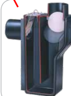
Unique Wisy® Multisiphon overflow unit