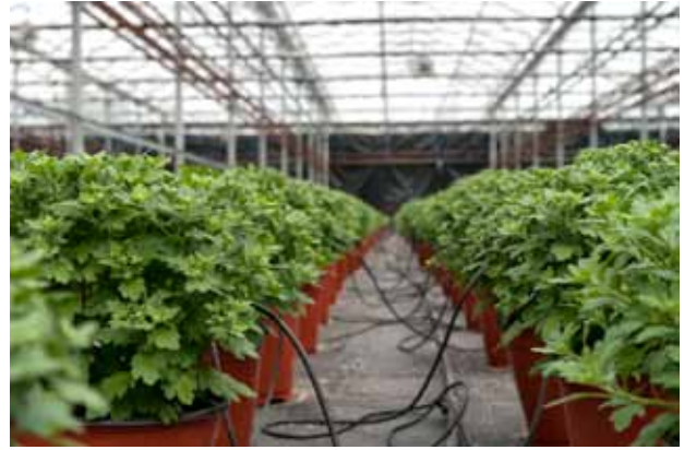
Naturally soft rainwater is perfect for irrigating plants

Our wide range of specialist components provides us with great scope to find the right solution for any situation. Using industry-leading filter units and control systems we can design a system that best fits the application, based on site requirements.