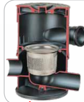
Wisy® Vortex Fine Filter (WFF) The Original and Unique Vortex filter.