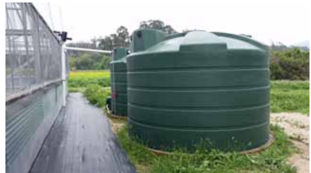
Above ground tanks are ideal for retro-fitting on existing buildings

Call to speak to one of our technical sales team.