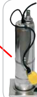
High quality submersible multi-stage pressure pumps