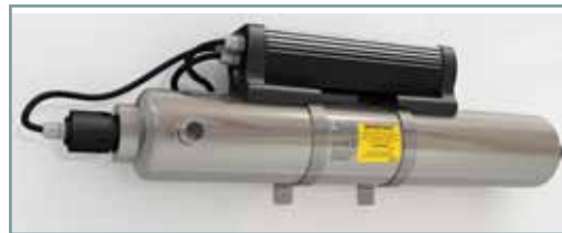
UV disinfection units are available for use where a sterilised water supply is required

Rainwater harvesting helps by reducing demand on mains water supplies by intercepting rainfall, which would otherwise be unrecoverable, and using it for applications that do not require potable water. Many agricultural and horticultural sites can benefit greatly from using rainwater, so farms, stables and plant nurseries can reduce water bills and alleviate stormwater run-off. Most roof surfaces are suitable as long as there is an efficient guttering system, and for many purposes simply filtering leaves and other debris is sufficient. Where necessary, rainwater can be further filtered and sterilised for safe use in more sensitive areas e.g. dairy or other foodstuffs.